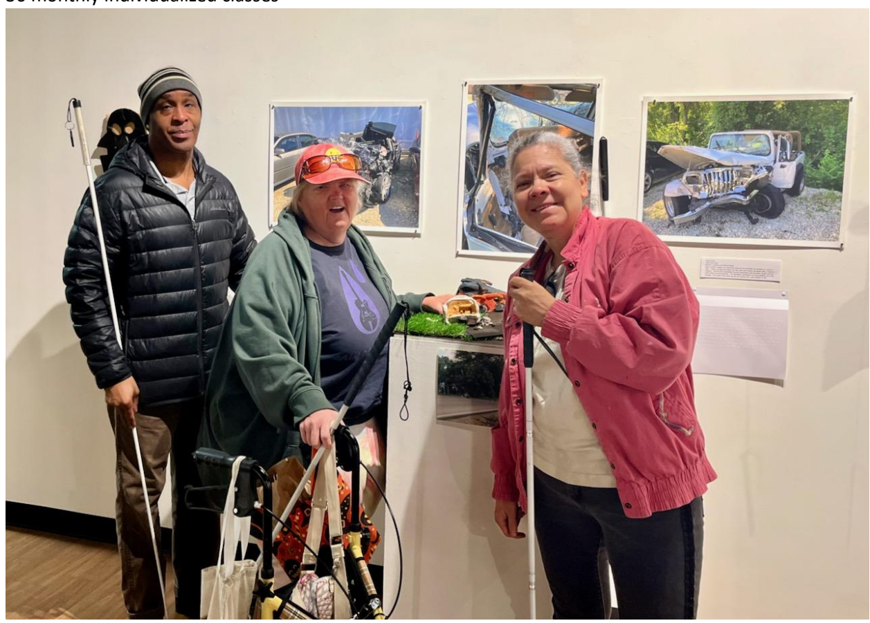
Older Blind students with a Center staff member examine tactile art pieces during the annual Shared Visions tactile art show at Arapahoe Community College.