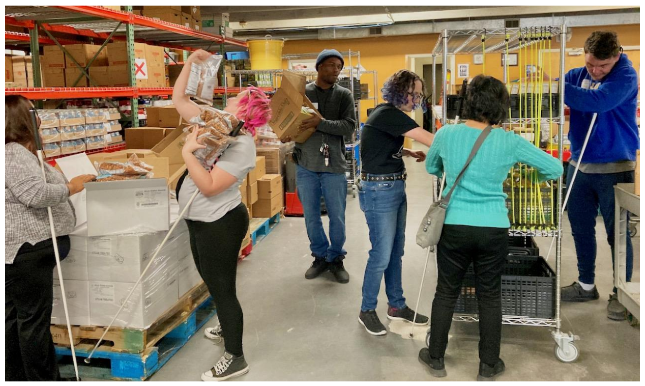
We also teach our blind students to give back. Here, students help to stock food bank shelves at nearby Integrated Family Community Services (IFCS).

72 students served in 2023 96% of students living independently post-graduation 28 community outreach events held 68% of students have multiple disabilities